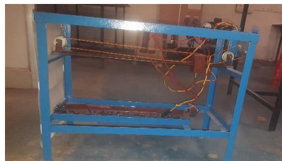
fig Experimental Setup

We have innovated a new method of automatic burr removal using a electromagnet as a working factor. The operation is trouble free due to better construction material of the component and their metallurgical control. The plan requires less space for installation, manufacturing and designing of suitable machining for it's appliances. The Automatic burr remover should be such that it's operation should be simple it's