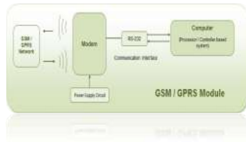
Fig. 2.Gsm And Gprs Module.

Gsm (Global System For Mobile Communications) Is An Open, Digital Cellular Technology Used For Transmitting Mobile Voice And Data Services. Here We Are Using It Only For Transmitting And Receiving The Messages. Gsm Wireless Data Module Is Used For Remote Wireless Applications, Machine To Machine Or User To Machine And Remote Data Communications In Many Applications. Microcontroller Sends At Commands To Gsm Modem And Accordingly It Operates.