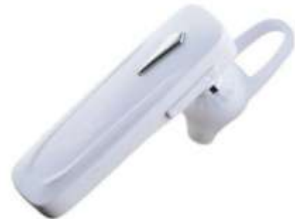
Fig. 7- Bluetooth Connectivity: