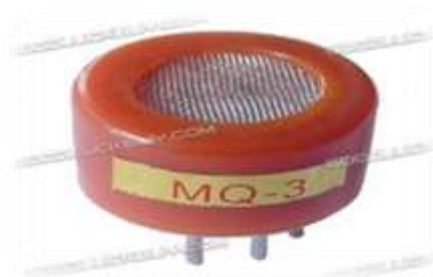
Fig. 8. Alcohol Detector:

It is used for measure the consumption of alcohol & it is continuously monitoring the rider.