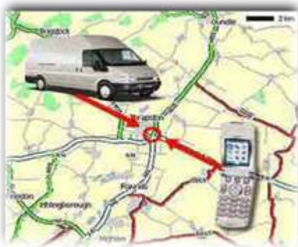
Fig 4. Gps Tracking Location.

The Gps Concept Is Based On Time And The Known Position Of Specialized Satellites. The Satellites Carry Very Stable Atomic Clocks That Are Synchronized With One Another And To Ground Clocks. Any Drift From True Time Maintained On The Ground Is Corrected Daily. Likewise, The Satellite Locations Are Known With Great Precision.