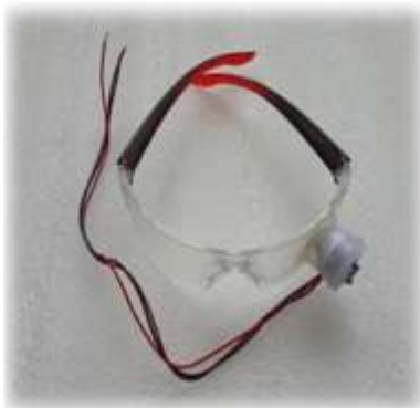
Fig. 6- Eye Blink Sensor

Eye Blink Sensor Is Used For Eye Blinking Measure Time